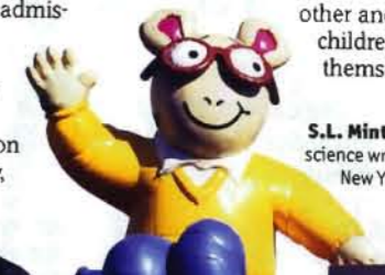
Sign for the Toy Museum in Valetta, Malta (above); inflatable figure on the Children's Museum in Boston, Massachusetts (far right)