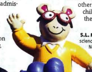
Sign for the Toy Museum in Valetta, Malta (above); inflatable figure on the Children's Museum in Boston, Massachusetts (far right)